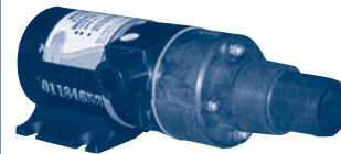
18590 / 18690