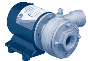
18510 / 18580