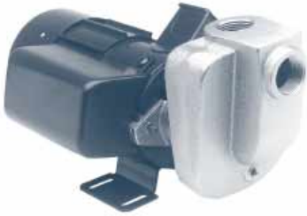
3/4" Ports, 1/8 hp