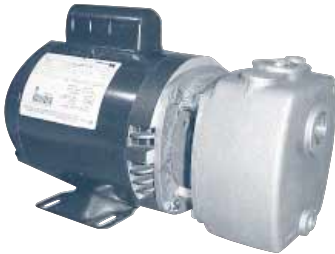
1" Ports, 300 Series