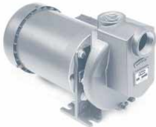
1 1/2" Ports, 3890 Series