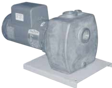
1 1/2" Ports, 750 Series