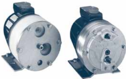
D10 - D35 Series