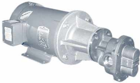
Bronze Gear Pumps