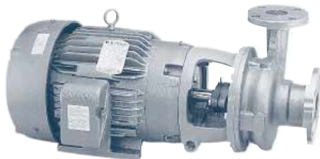
NAVAL Bronze Centrifugal