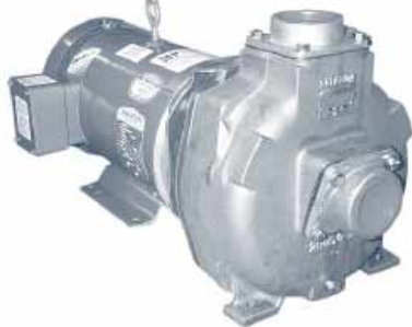
Bronze or CI Centrifugal