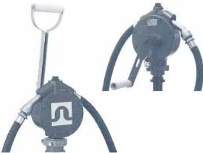
Piston, Rotary Hand Operated