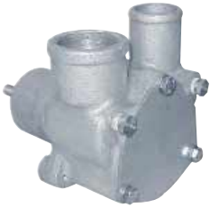
P176 (Old # P171)