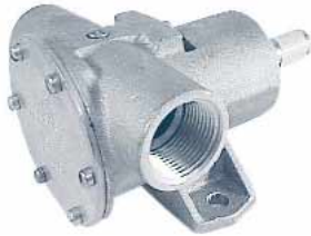
777-9001 (1" Ports)