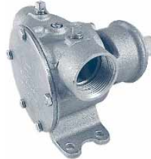
6400-1051 (1 1/4" Ports)