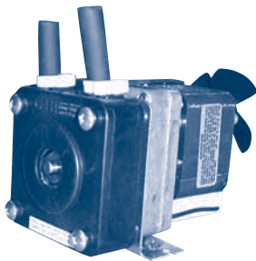
Compact (up to 350 ml/min)