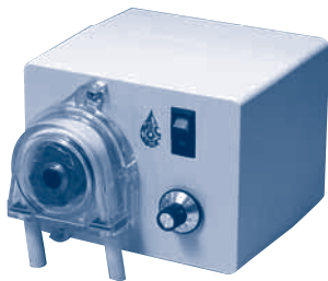
Dolphin and 2400T Series