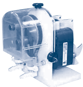
Mini (up to 500 ml/min)