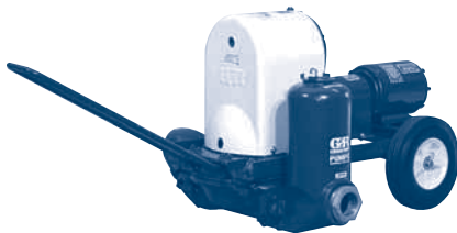
2" and 3" XP Series