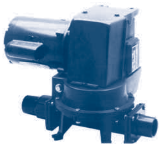
2" Electric and Gas Series