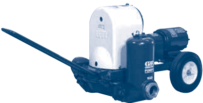
4" D Series