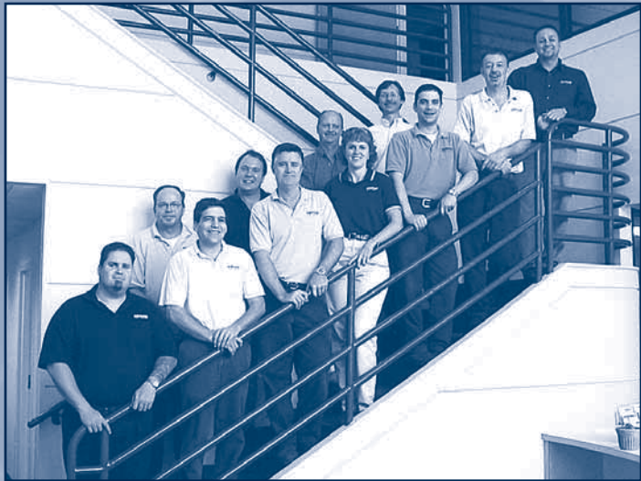
Our Pump Specialists