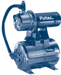
3/4 HP Stainless Steel