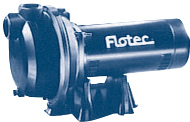
Self-Priming Sprinkler Pump