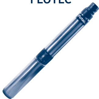
4" Submersible Well