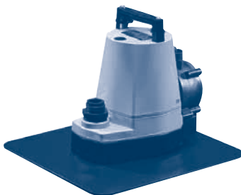
Pool Cover / Roof / Utility