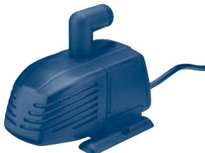
Swimming Pool Cover