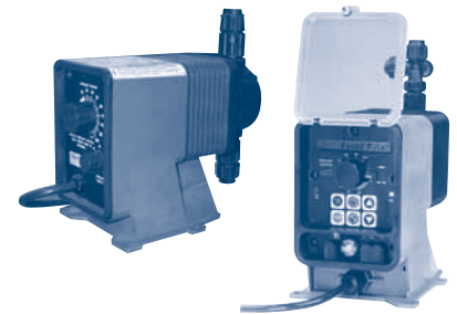
Manual, 4-20MA and Programmable