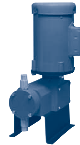
Mechanically Driven M Series