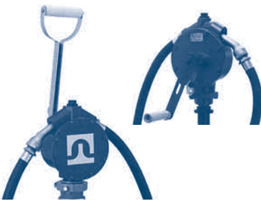
Piston, Rotary Hand Operated