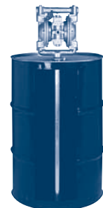
Air Operated Drum Pump