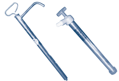
Stainless and Brass