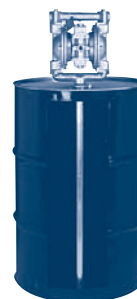
Air Operated Drum Pump