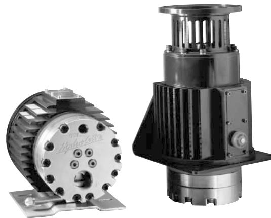
D15 Series – 12.5 gpm, 2500 psi max.