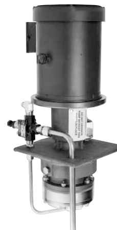
D12 Series – 8 gpm, 1000 psi max.