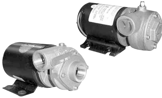
Bronze Recirculating Series