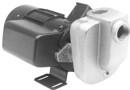
Compact 12 vdc and 115 vac