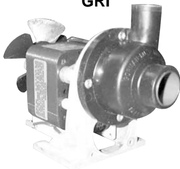
Compact Plastic Centrifugals