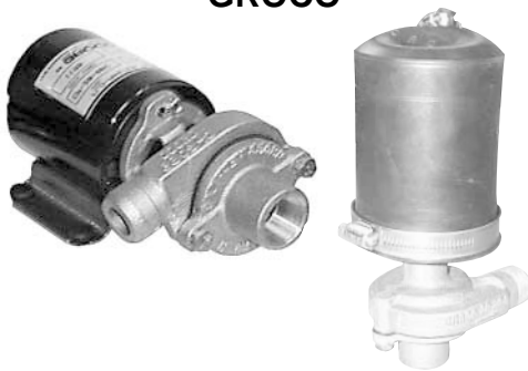
Open-Air or Submersible