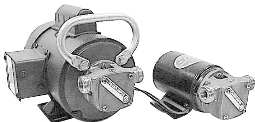
211D (3/4") & 201D (3/4") SERIES