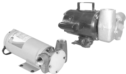
3/4", 1" & 1 1/2" Dry Running Series