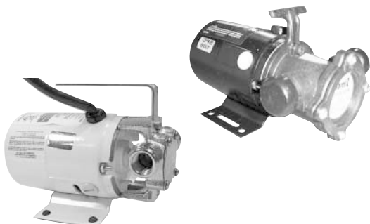
360 Series / "Mini-Vac" Series (3/4")