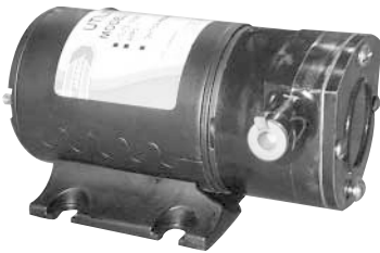
Compact AC & DC Non-Metallic