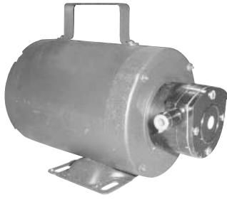
115 VAC, Non-Metallic