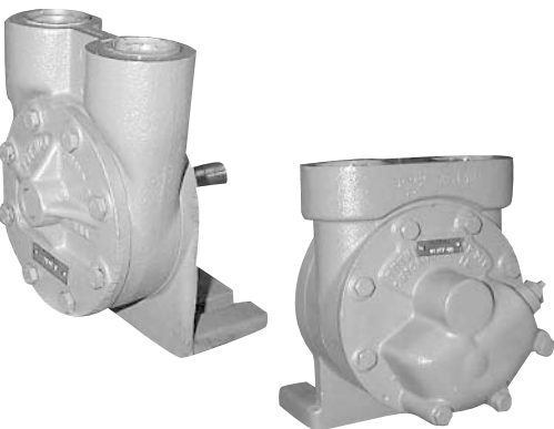
C1E and C1EN Series