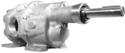
N26HDM, P, L