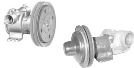
See page 27