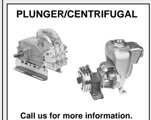
N994C, 1/2" Ports