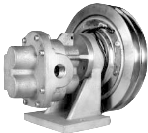
N994C, N970C, N990C