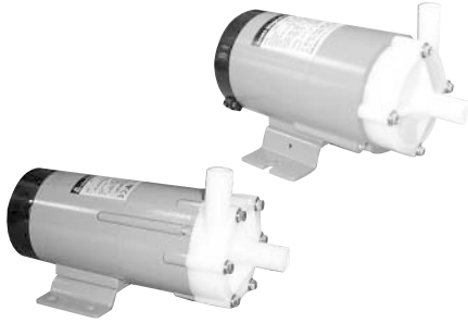
Developing & Silver Recovery