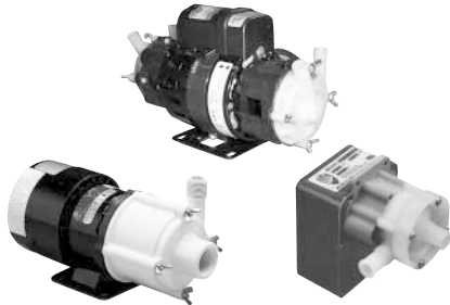
Developing & Silver Recovery