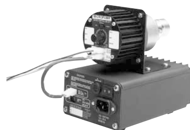
Stainless, Hastelloy & Ryton