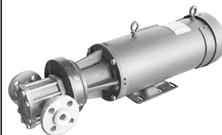
Stainless, Hastelloy & Ryton