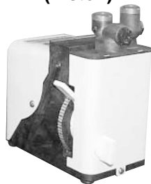
1000 cc/min, 160 psi