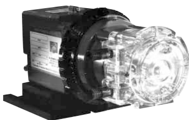
170 gpd, 100 psi