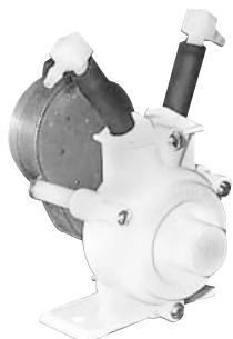
Up to 20 Gallons Per Month!