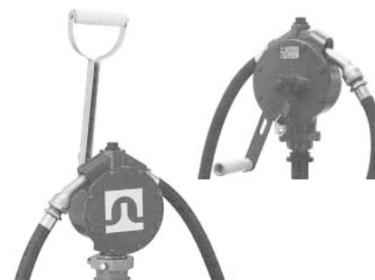
Piston, Rotary Hand Operated