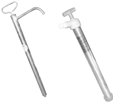
Stainless & Brass