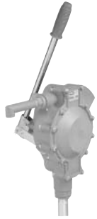
Polypropylene, Ryton, Nylon, Polyester & Halar