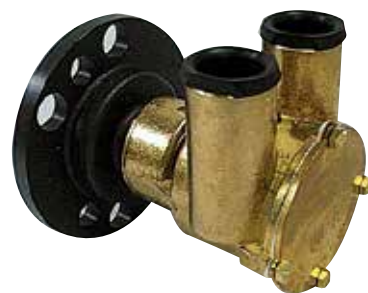
F5B-9 / F6B-9