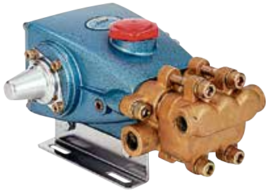
Shaft Driven Series