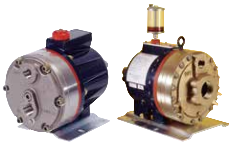
D10 - D35 Series