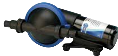
50880 / 50890