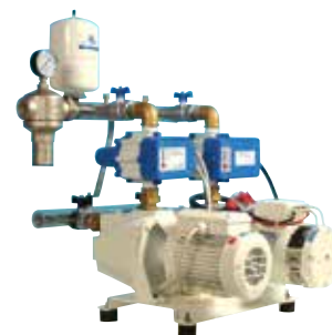
Custom Designed Systems