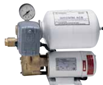
Idromini ACB Series