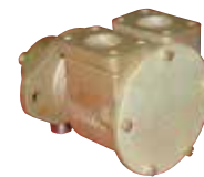
21180 / 21180-05