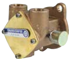
202M-3, 202M-7 N202M-3, N202M-7