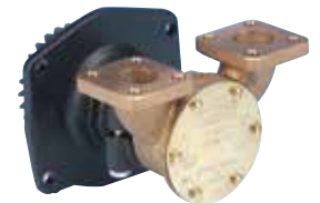
10970 (Threaded Ports) 10970-21 (Flanged Ports)