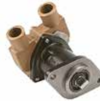
G701 / G702