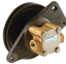
GP8002 / G8002