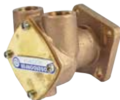
202M-16 / N202M-16