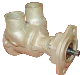
30890 / 30900