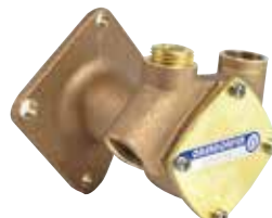
202M-17 / N202M-17