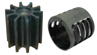
Impeller and Cam Cross Reference