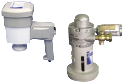
Electric and Pneumatic Motors