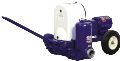
2" and 3" XP Series