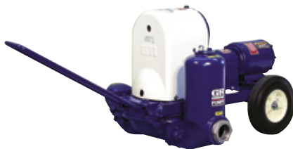
4" D Series