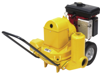
2" and 3" Gas and Electric Series