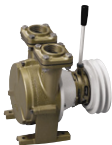
Clutch Drive FC and FS