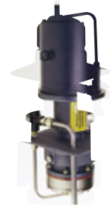
D12 Series - 8 gpm