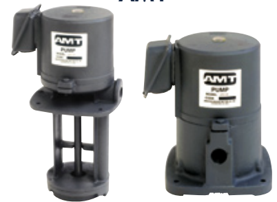
Immersion Series Suction Series