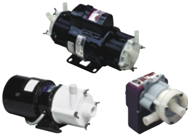
Developing and Silver Recovery