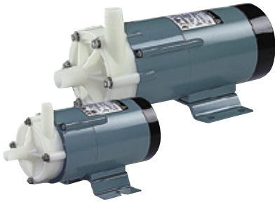
Developing and Silver Recovery