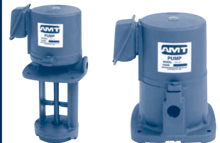
Immersion Series Suction Series