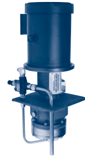
D12 Series - 8 gpm