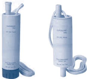
2" Submersible Well Pump