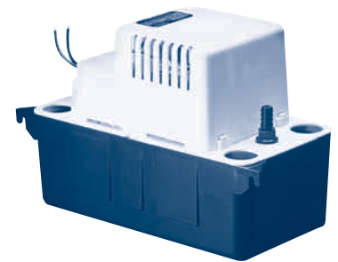
New Generation VCMA Series