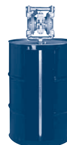
Air Operated Drum Pump