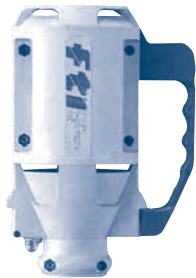
Electric Drum Pump Motors