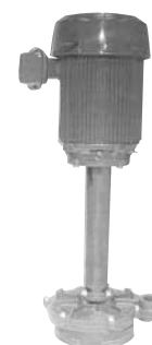
Sealless w/Mounting Plate