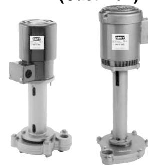
3/4" to 1 1/2 NPT, Coolant Pumps