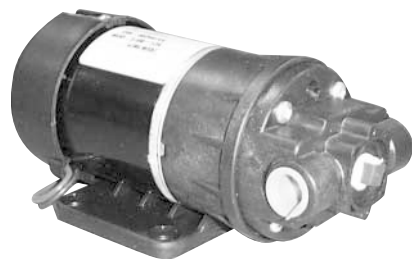
2100 By-pass Series (2 gpm, 45 psi)