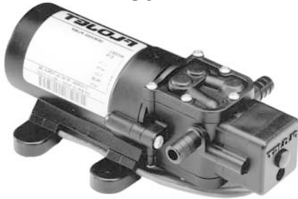
LF Series (1gpm, 35 psi)