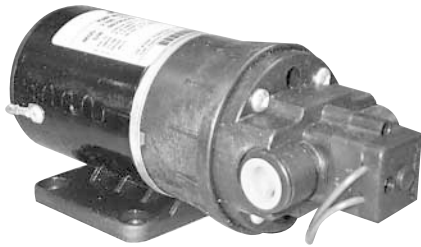
2100 Demand Series (2 gpm, 60 psi)