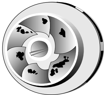
What Cavitation (Low NPSH) Will Do To Your Impeller