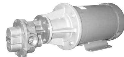
N1100 (1 1/4" Ports)