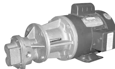
N994 (1/2" Ports)