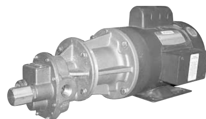
N970 (3/4" Ports)