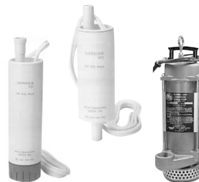
Well Test & Dewatering