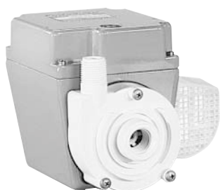
Submersible or In-line Series