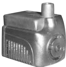
TABLE TOP FOUNTAIN

Here's a little submersible that will fit just about anywhere. It's only 2 3/4" high, 2 5/8" wide and 2" long, and is mostly used in table top fountains. I bet you can find other places for it! (See page 124)